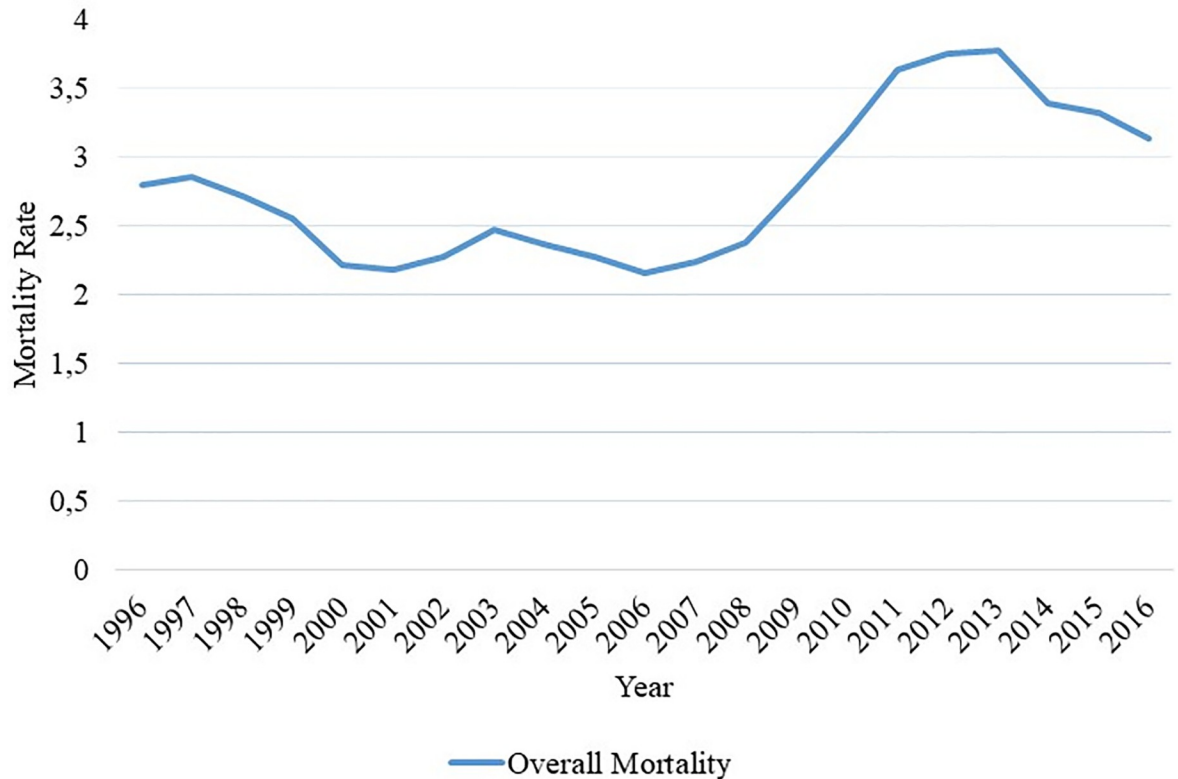
Fig 1. Overall mortality by CKD in Espírito Santo, Brazil, from 1996 to 2016.

https://doi.org/10.1371/journal.pone.0224889.g001