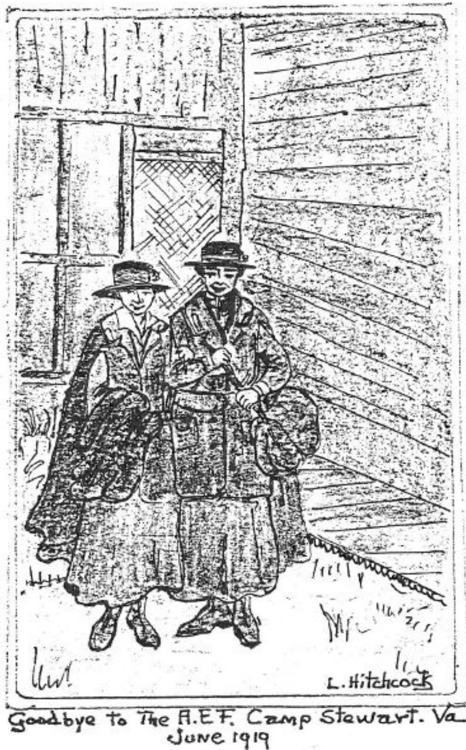
Figure 3: Hitchcock, L. (n.d) 'Goodbye to the A.E.F. Camp Stewart, Va. June 1919' from The Great Adventure, unpublished, p. 125, Illus.