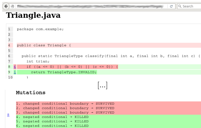
Figure 1: Example of output of PIT.

The HTML report generated by PIT uses a colour code to show both the line coverage and the mutation score, see Figure 1 that displays a report on an example application 2 . Light green lines correspond to code coverage with no mutant generated: line 11 in the example. Dark green correspond to the lines for which tests were executed and failed (which means the mutants were killed): this represents the mutation coverage , for instance lines 9, 12 and 13 in the example. Light pink shows lines with no code coverage (outside the scope of the tests): line 4 in the example. Dark pink is used to show instructions on which mutants were generated and not detected by the tests (surviving mutants): line 8.